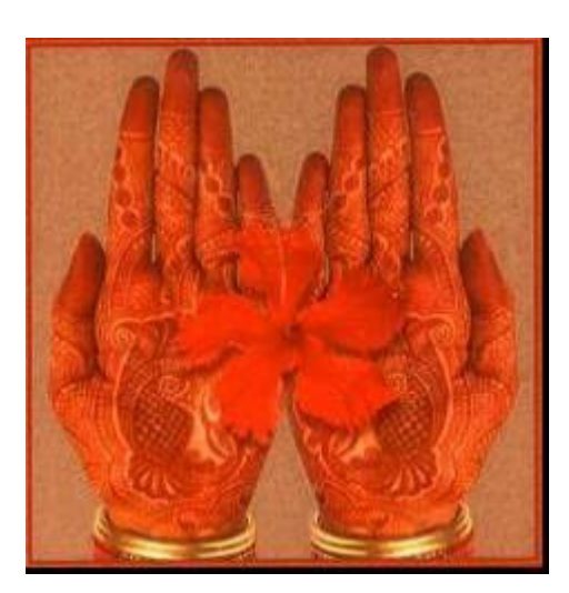
Welcome to India!